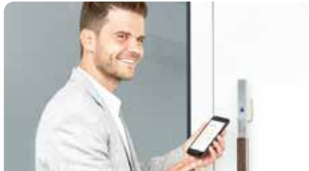
The ekey dLine fingerprint scanner In the door leaf or door handle

Thanks to the ekey dLine, you get secure and keyless access to your home. The front door becomes smart and receives new functions that inspire you in everyday life.