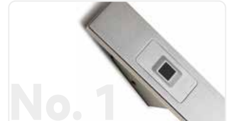
The market leader ekey Europe's No. 1 for fingerprint scanner access solutions